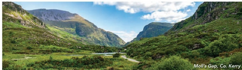
Moll's Gap, Co. Kerry

Embark on Ireland's most popular 100-mile scenic drive – the Ring of Kerry. This winding route reveals breathtaking views of Macgillycuddy's Reeks as well as the scenic coast of beaches and cliffs. There will be plenty of stops for photos at the best vantage points. After a casual lunch in a cozy restaurant, you'll continue your scenic drive to Valentia Island where you'll visit the Skellig Michael where early Christian monks lived in austere conditions and how it was used as one of the locations for the film "Star Wars VII." Pause for a stroll around Sneem, with its brightly painted houses, and at Moll's Gap for panoramic views of Ireland's highest mountains and deep valleys. Get a taste of farm life with a demonstration of a sheepdog herding flocks, a shearing demonstration (seasonal), and see different breeds of sheep. Return to Killarney and enjoy a free evening for independent dining or exploring the many pubs in the town. (B, L)